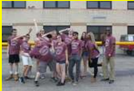
@CHILIYOUTHGROUPS September 2015 Newsletter

Name: Chili Presbyterian Youth Groups Location: Rochester, New York Web: chili-presbyterian.org Bio: Jr. and Sr. High youth groups looking to strengthen their faith in Christ and build lifelong relationships with others.