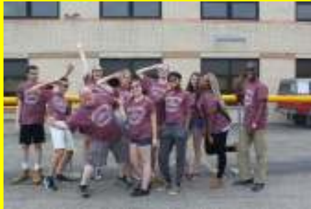
@CHILIYOUTHGROUPS January 2016 Newsletter

Name: Chili Presbyterian Youth Groups Location: Rochester, New York Web: chili-presbyterian.org Bio: Looking to strengthen our faith in Christ and build lifelong relationships with others.