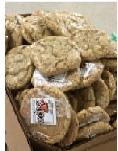
Chicken BBQ cookies – Oh how I miss thee.