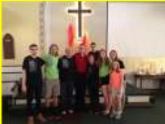
@CHILIYOUTHGROUPS October 2014 Newsletter

Name: Chili Presbyterian Youth Groups Location: Rochester, New York Web: chili-presbyterian.org Bio: Jr. and Sr. High youth groups looking to strengthen their faith in Christ and build lifelong relationships with others.