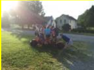
@CHILIYOUTHGROUPS October 2016 Newsletter

Name: Chili Presbyterian Youth Groups Location: Rochester, New York Web: chili-presbyterian.org Bio: Jr. and Sr. High youth groups looking to strengthen their faith in Christ and build lifelong relationships with others.