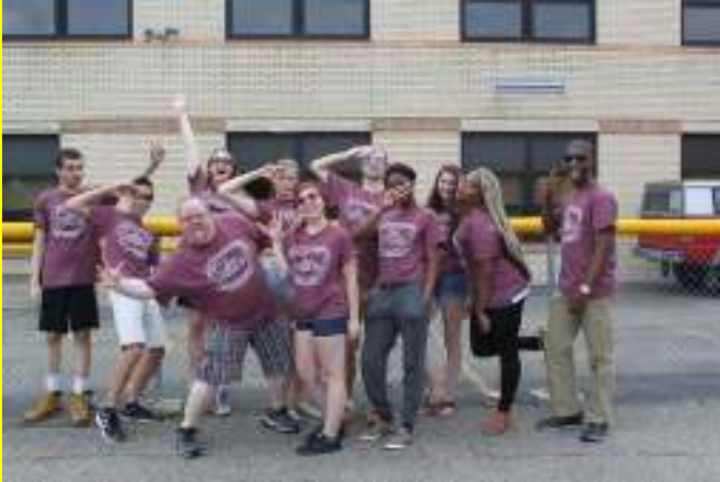
@CHILIYOUTHGROUPS September 2016 Newsletter

Name: Chili Presbyterian Youth Groups Location: Rochester, New York Web: chili-presbyterian.org Bio: Jr. and Sr. High youth groups looking to strengthen their faith in Christ and build lifelong relationships with others.