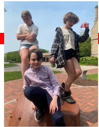
The coolest kids on the block!